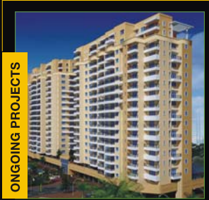
Raj Lakeview Phase II