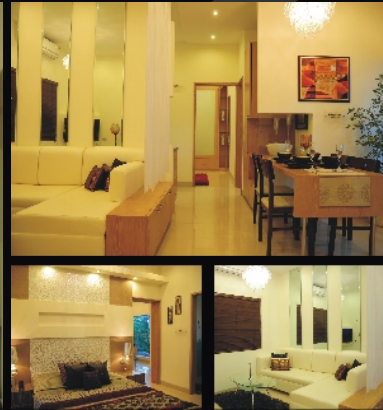
Actual Model Apartment Photographs

SNN Raj Serenity is about everything very thoughtfully chosen, right down to the screws and nails.